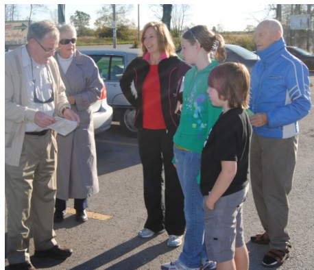
Explaining the distribution routes

Please call and ask if you can help. Phone calls need to be made, brochures distributed, and signs put up.